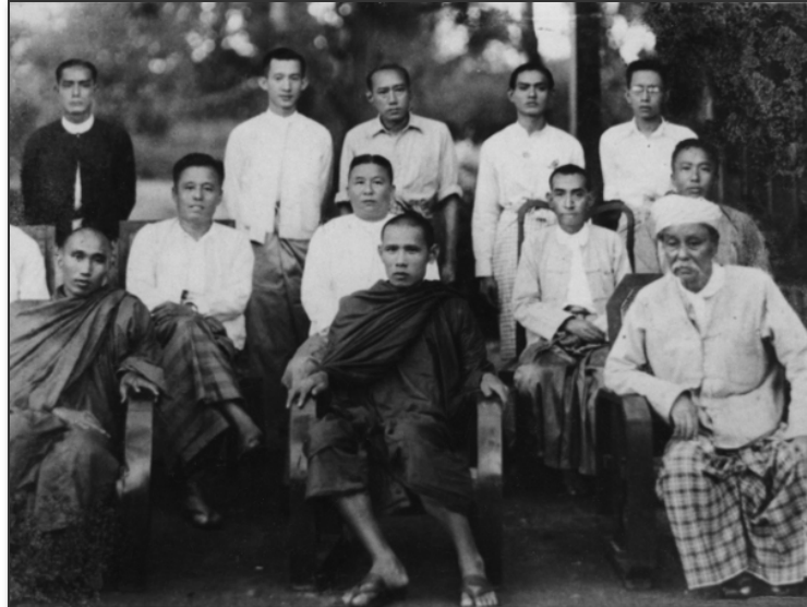
WITH THE TEMPLE COMMITTEE IN RANGOON