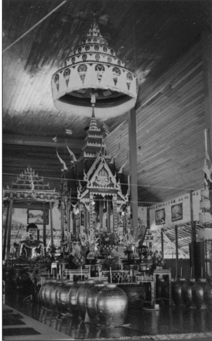
PREPARATIONS FOR THE CONSECRATION CEREMONY, THE FESTIVAL CELEBRATING 25 CENTURIES OF BUDDHISM, WAT ASOKARAM, 1957