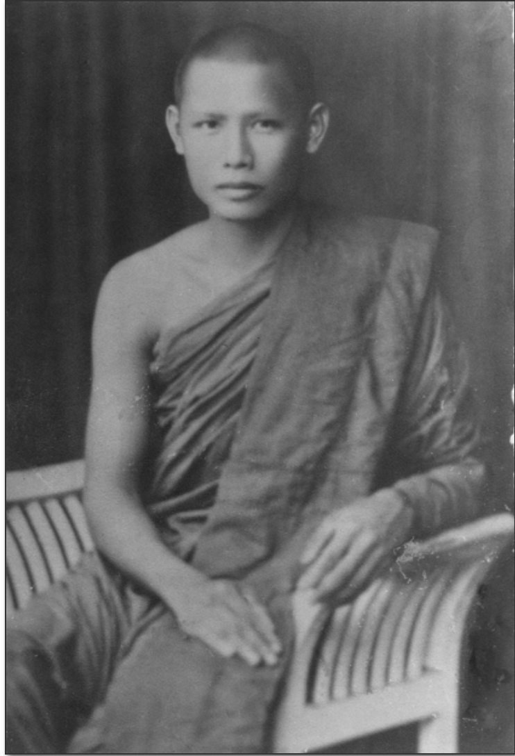
KORAT, C. 1932