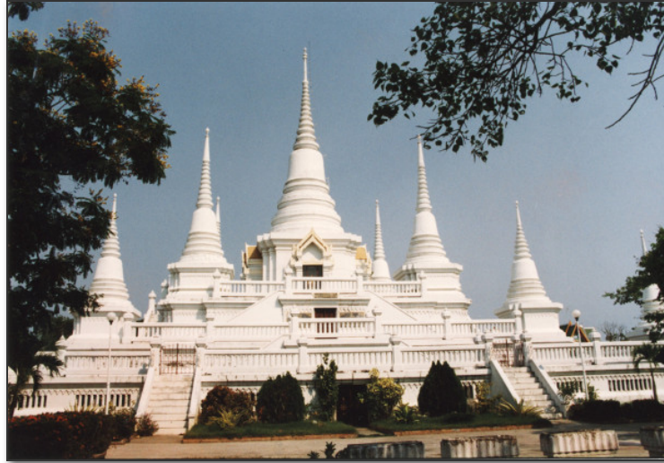
THE ORIGINAL THIRTEEN-SPIRED CHEDI, WAT ASOKARAM