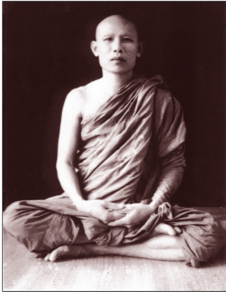
PHRA AJAAN LEE DHAMMADHARO (1906-1961)