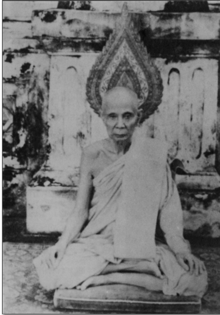
SOMDET PHRA MAHAWIRAWONG (TISSO, UAN)